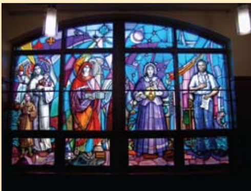
Windows in the College of Nursing Chapel