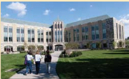
Driscoll Hall—new home of the Villanova College of Nursing.

*Cited from the Dedication and Blessing of Driscoll Hall Program .