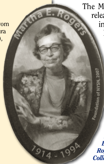
Martha Elizabeth Rogers Collector's Pin

The Martha Elizabeth Rogers pin, released in September 2007, is one in a collection of 15 Center for Nursing History limited edition pins honoring nurses who have contributed to the rich history of nursing in New York. To view all of the pins and additional items for purchase, go to: http://www.foundationnysnurses.org/giftshop.htm